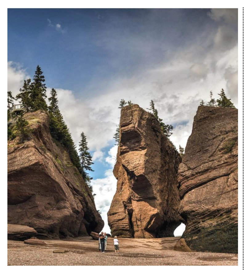
11 Days • 16 Meals: 10 Breakfasts, 2 Lunches, 4 Dinners

HIGHLIGHTS... Halifax, Peggy's Cove, Mahone Bay, Lunenburg, Choice on Tour, Cape Breton Island, Cabot Trail, Prince Edward Island, Anne of Green Gables Museum, Hopewell Rocks, Fundy Trail, Grand Pré National Historic Site