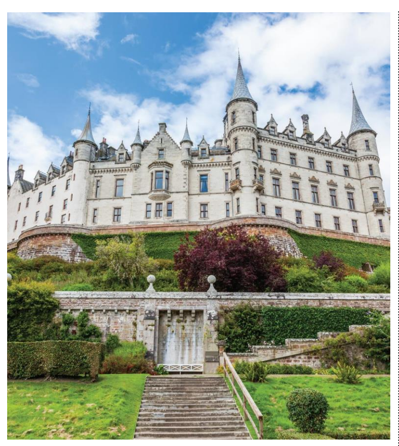
14 Days • 19 Meals: 12 Breakfasts, 7 Dinners

HIGHLIGHTS... Bagpipe Demonstration, Whisky Tasting, Isle of Skye, Loch Ness, Orkney Islands, Dunrobin Castle, Culloden Battlefield, Sheepdog Demonstration, Edinburgh Castle, Scottish Cooking Demonstration